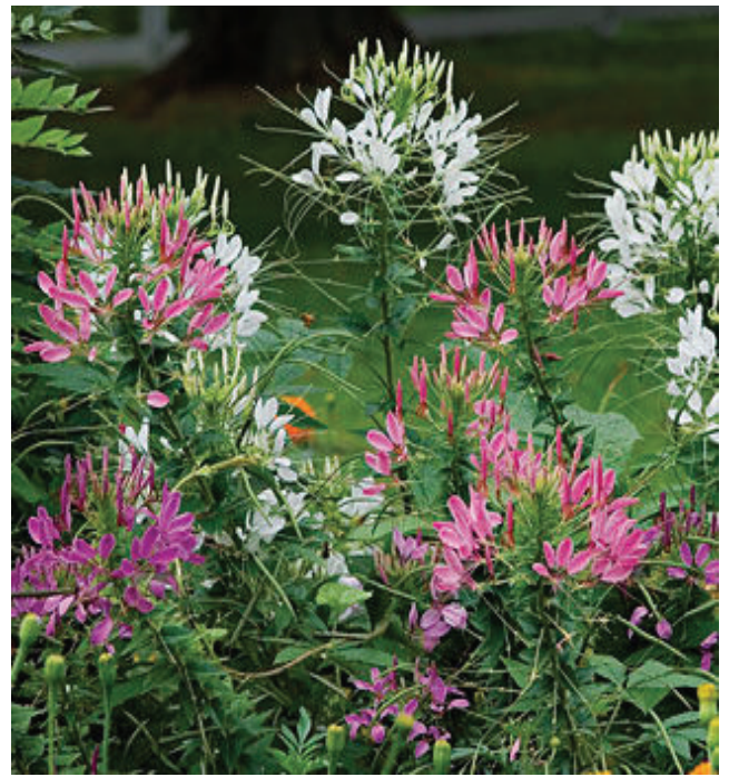
Cleome: Also known as Spider flower, this plant will make the back of your border a focal point. It will self sow.