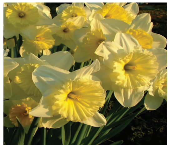
Above, Narcissus 'Flower Record', N. 'Mount Hood', N. 'Ice Follies'.