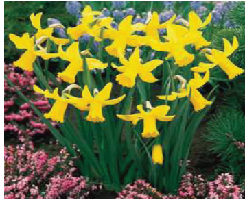
N. February Gold, a mini size