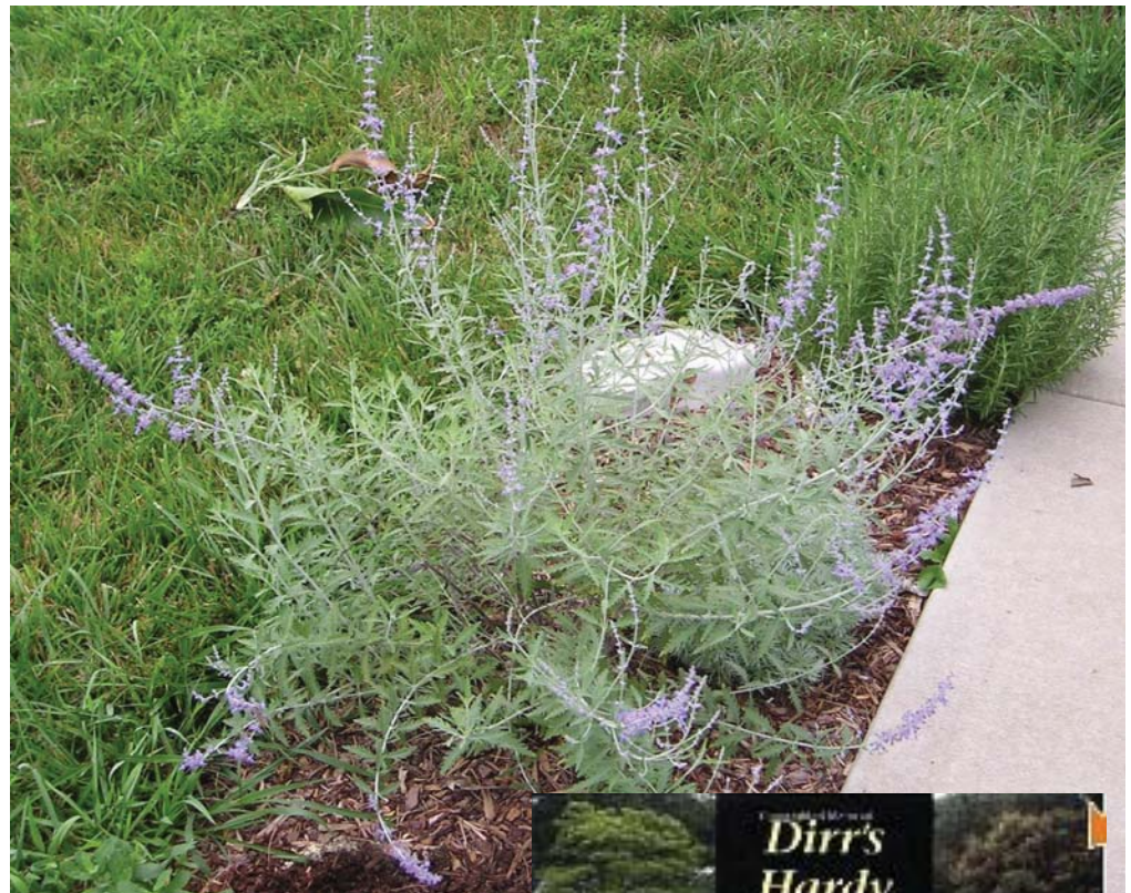
Perovskia has gray green leaves in the winter landscape.