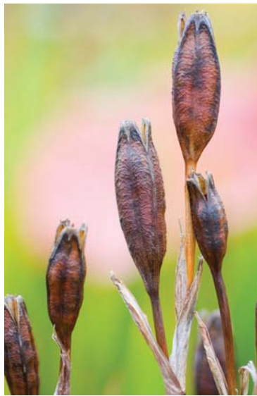
Iris Siberica seed heads